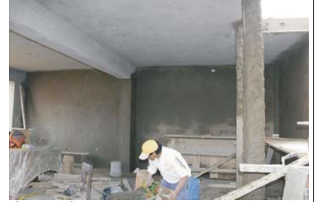
Second floor, now with stucco on the walls.

Please continue to pray with us as we move forward with this project.