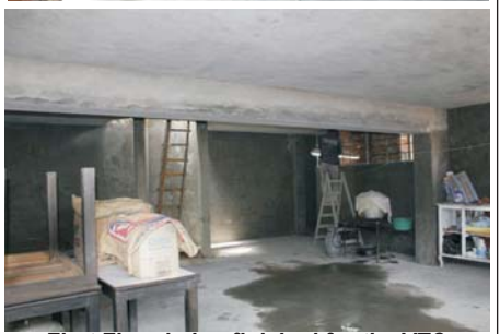
First Floor being finished for the VTC.