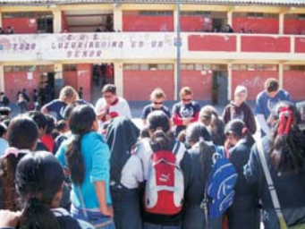
Youth giving their hearts to the Jesus