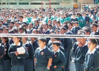
Public school ministry in Huaraz