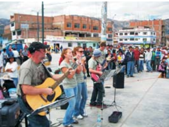
Team ministering on the streets in Huaraz

The second week of the trip we were joined by six others to help with the ministry in the churches and with the youth camp. Five were from Calvary Chapel in Greensburg, Pa and one a friend of ours from Georgia. It's wonderful to report the Peru Youth Camp was everything we hoped it would be! We had 160 in attendance and had amazing times of ministry with many people coming forward to give their hearts to the Lord or to make new commitments to God. We had split teaching sessions in the morning for the guys and the girls. Our guys and girls ministered to them on how to be men and women of God. The last morning we had the Peruvian youth minister in drama and dance. After one of the dance teams shared, I mentioned to one of the team leaders that we wanted some of them on our first Peruvian youth team planned for February. She began to cry saying I have dreamed of being a missionary." Her prayers are being answered! They're excited about the opportunity to go and do what they have seen us do and want to go and do the same. We had eight churches involved in the camp and The Peruvian pastors and youth leaders were overjoyed to have the opportunity to bring their youth. The pastors have reported back that their youth have a renewed passion, excitement and commitment to follow the Lord. SPECIAL THANKS TO ALL OF YOU WHO HELPED THROUGH YOUR PRAYERS AND FINANCIAL SUPPORT!