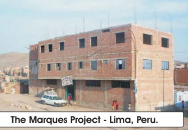
The Marques Project - Lima, Peru.

In closing, we praise God for all the opportunities He is giving us to serve Him together in world missions and welcome your participation in any of these ventures!