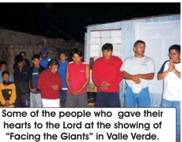
Some of the people who gave their hearts to the Lord at the showing of "Facing the Giants" in Valle Verde.