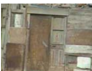
If you own a home and a car you are one of the 5% richest people in the world!