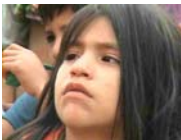
Missionary Ventures Feeding Centers change the lives of children